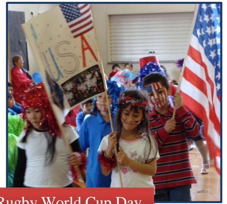
Positive Power Rugby World Cup Day