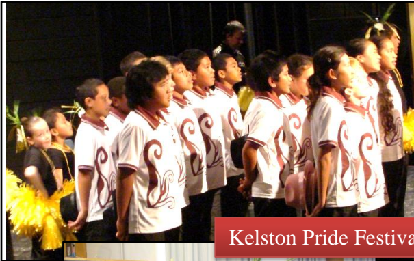
Kelston Pride Festival